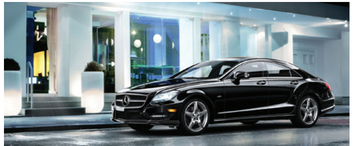
Quickly create stunning photorealistic renderings using 3ds Max and NVIDIA GPUs.

With the NVIDIA® Iray® renderer in 3ds Max you can render more than 18x faster using NVIDIA Multi-GPU technology while still working with all your other software applications. Now Iray Server distributed rendering software is available from NVIDIA to harness the power of networked workstations for even faster rendering. This enables you to reduce, or in some cases eliminate, the number of expensive and time-consuming physical prototypes needed.