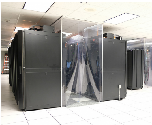
Figure 1. The Palmetto HPC infrastructure.