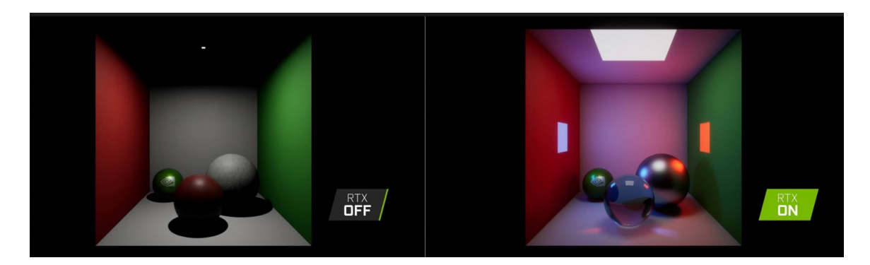
Figure 3. Benefits of Real-Time Rendering with NVIDIA RTX Technology

The NVIDIA Turing architecture of the T4 fuses real-time ray tracing, AI, simulation, and rasterization to fundamentally change computer graphics. Dedicated ray-tracing processors called RT Cores accelerate the computation of how light travels in 3D environments. NVIDIA Turing accelerates real-time ray tracing over the previous-generation NVIDIA<sup>®</sup> Pascal<sup>™</sup> architecture and can render final frames for film effects faster than CPUs. The new Tensor Cores, processors that accelerate deep learning training and inference, accelerate AI-enhanced graphics features—such as denoising, resolution scaling, and video re-timing—creating applications with powerful new capabilities.