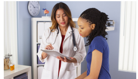
Figure 3. University of Florida uses AI for clinical decision support

Natural Language Processing (NLP): The University of Florida is using NVIDIA DGX SuperPOD™ for important research, and built GatorTron , the largest clinical language model to date. Using pre-trained models from NGC™ and trained on records from more than 50 million interactions with 2 million patients, this breakthrough can help identify patients for lifesaving clinical trials, predict and alert health teams about life-threatening conditions, and provide clinical decision support to doctors.