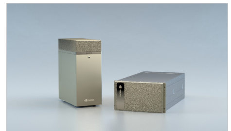
Figure 5. NVIDIA DGX systems

A solid foundation in AI will be a critical enabler and differentiator for graduates entering the workforce as employers continue on the path of digital transformation.