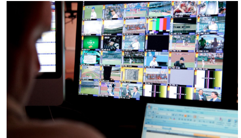
Figure 2. NYU uses AI for predictive analytics in sports

Computer Vision: Predictive analytics, commonly used in business to identify risks and opportunities, is increasingly used by the sports industry to tap into massive amounts of data. But the amount of data is vast — one season’s worth of data alone is about 700,000 at-bats, which represents about a terabyte and a half of data. Scientists at New York University (NYU) are applying deep learning using the DGX system to analyze unprecedented amounts of Major League Baseball (MLB) data to analyze every player’s every move and help improve the game.