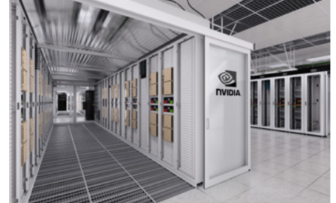
A Blueprint for Scaling AI NVIDIA powers its own critical AI research and development with DGX SATURNV, the world's largest proving ground for AI, built on more than 2,000 DGX nodes. Using NVIDIA's applied AI insights and DGX SuperPOD or DGX BasePOD architecture customers can easily build their own world-class computing cluster.

More than a server or workstation, a DGX system is a complete hardware and software platform backed by thousands of AI experts at NVIDIA. Owning a DGX system gives you direct access to NVIDIA DGXperts , a global team of AI-fluent practitioners that offer prescriptive guidance and design expertise to help fast-track AI transformation. This ensures mission-critical applications get up and running quickly and stay running smoothly, dramatically improving time to insights.