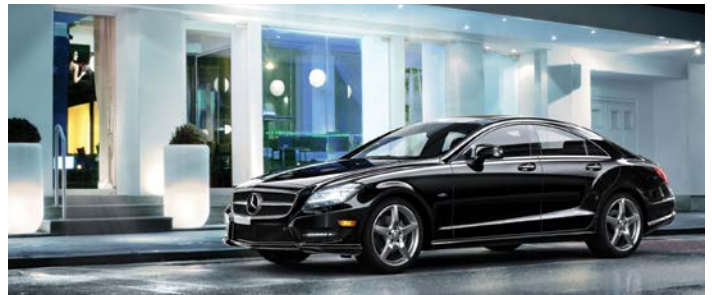
Quickly create stunning photorealistic renderings using 3ds Max and NVIDIA GPUs.

Now, with the NVIDIA® Iray® renderer in 3ds Max you can render more than 8x faster using NVIDIA Multi-GPU technology while still working in all your other apps. This enables you to reduce, or in some cases eliminate, the number of expensive and time-consuming physical prototypes needed.