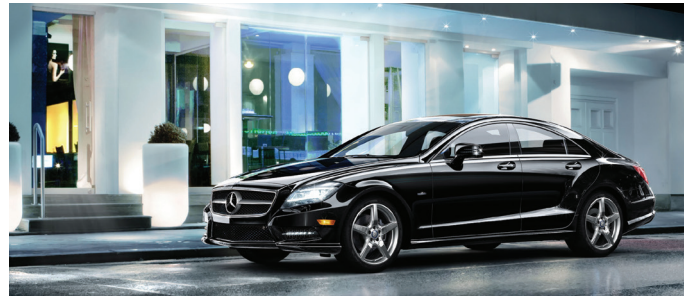
Quickly create stunning photorealistic renderings using 3ds Max and NVIDIA GPUs.