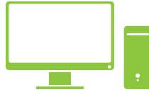
NVIDIA GRID VIRTUAL PC