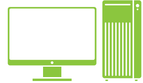
NVIDIA GRID VIRTUAL WORKSTATION

For organizations deploying XenApp or other RDSH solutions. Designed to deliver PC Windows applications at full performance.