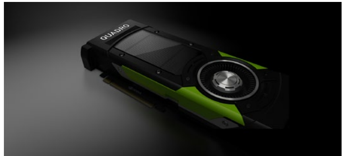
Quadro for Mobile Workstations