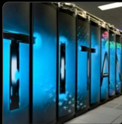
HPC, DATA CENTERS AND CLOUD