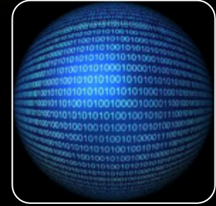
Big data analytics